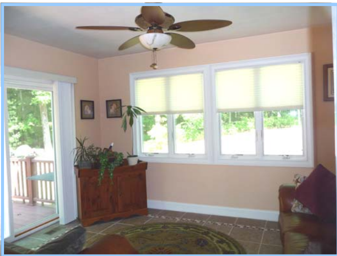
1ST FLOOR DEN/PLAYROOM