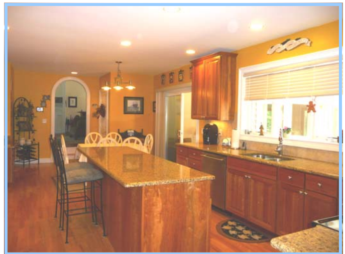
LARGE INVITING KITCHEN