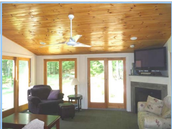
4 SEASON SUNROOM/GAS FIREPLACE