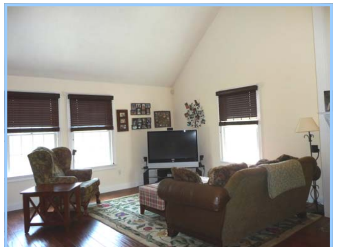
GREAT ROOM TV AREA