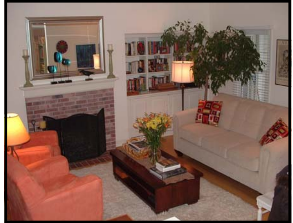
FAMILY ROOM with Built-ins