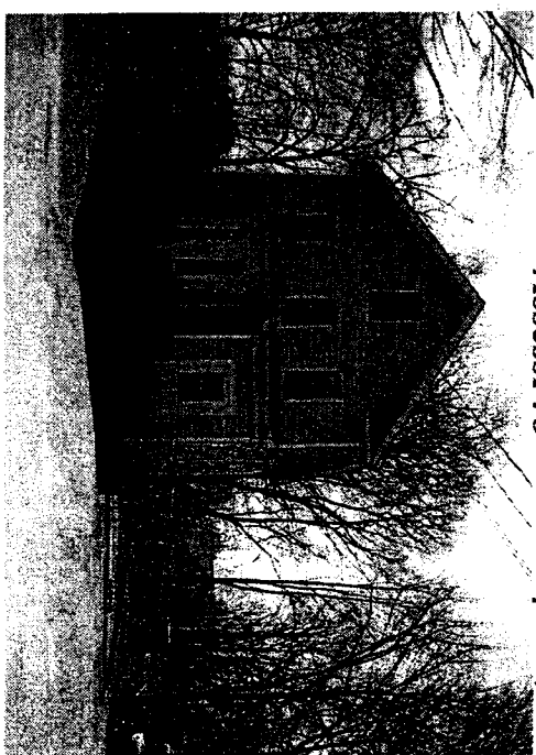
AssessPro Patriot Properties, Inc