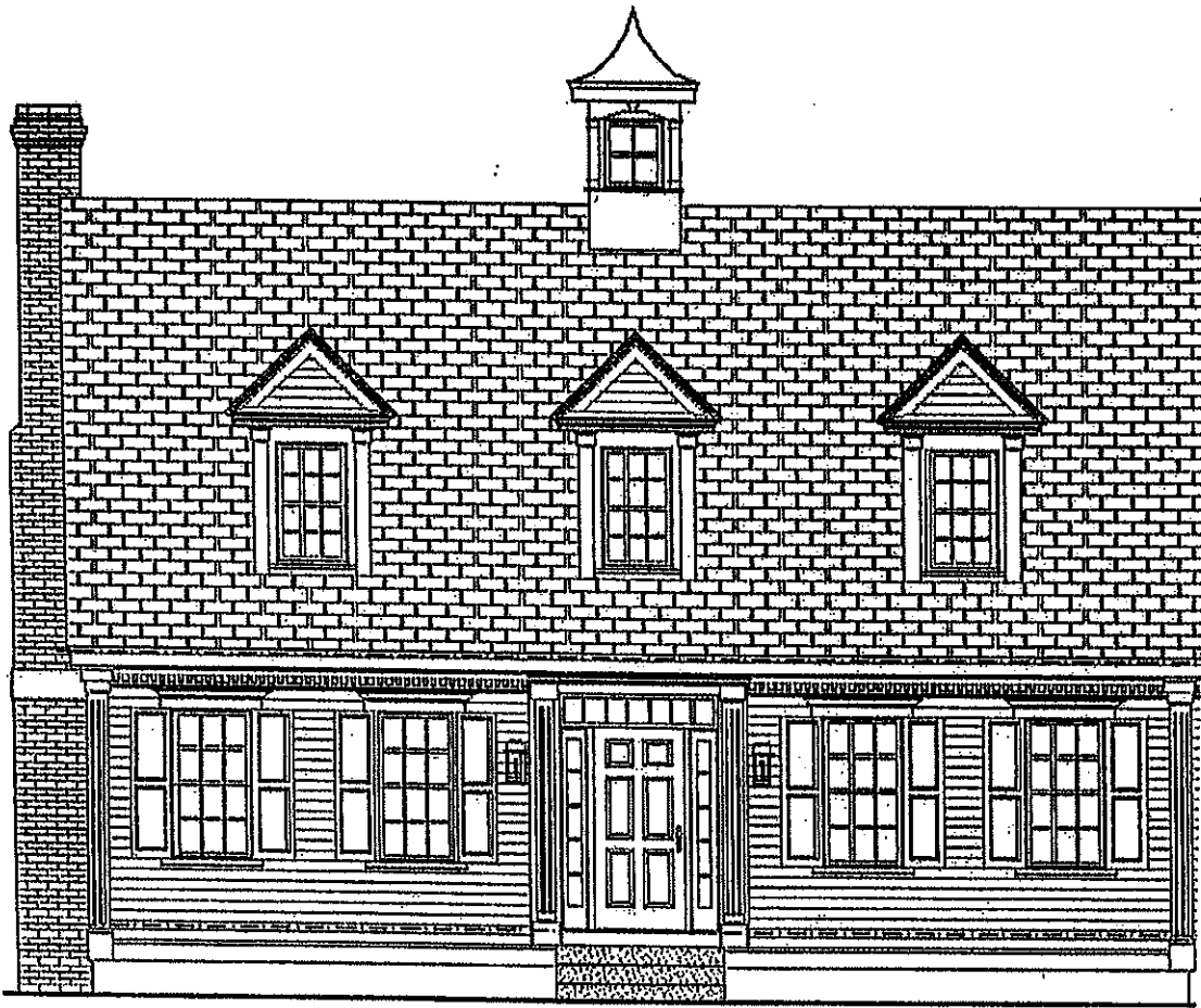
CAPE COD FRONT ELEVATION