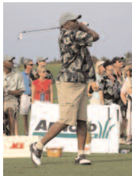
NFL legend Tim Brown tees off to help kids treated at Children's Miracle Network hospitals.